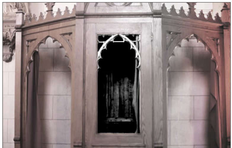
typical confessional booth exterior

The confessional portion of the CE would be either purchased from a nearby bankrupt church or fabricated by Enrico and others in the KT collaborative. The outside will have a professional, wooden structure w/ 3 apparent areas for human entrance. The middle portion [ where the priest traditionally resides ] would be filled with technological accoutrements to feed the other booths with the end-user | participant experience. Each of the 2 side booths would be equipped with many screens, and a comfortable interior. 2 participants are allowed inside the project for 2 minutes at a time. A light outside would signal the appropriate time to enter the confessional booths. Some other 'Dr Who'-ish lights may adorn the exterior front face of the structure. Some campy references to the heavens would decorate the top of the contraption : a radar-dish, TV bunny ears, and other references to technology that pulls data from the sky.