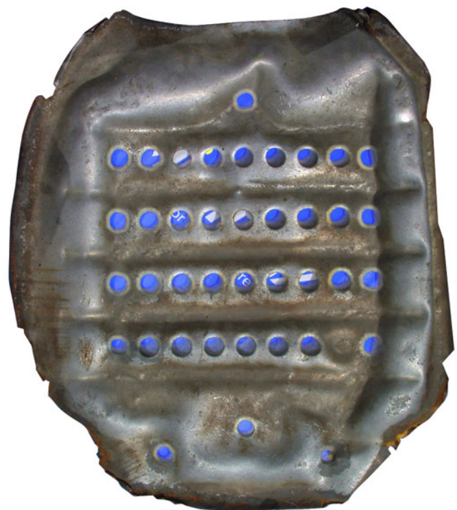
proposed face surface for 'commuter' monologue | station

Ultimately I would like to give each gallery goer a portable headset device that they wear for the duration of their stay in the space. As they move toward one of the 'video stations', the monologue that corresponds to that station's video would become louder + clearer [ hopefully some radio static or AM airwave effect would slowly clear up as the gallery goer approaches the